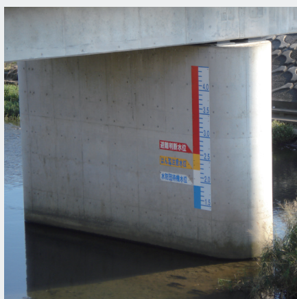
Example: Staff Gauge for River